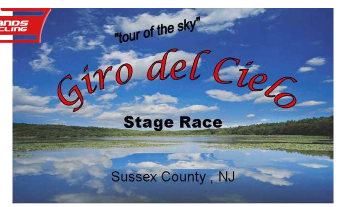
Table of Contents Cover Welcome Rules Information Venues Lodging Directions