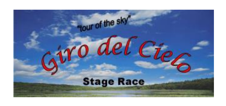
July 9 & 10, 2016